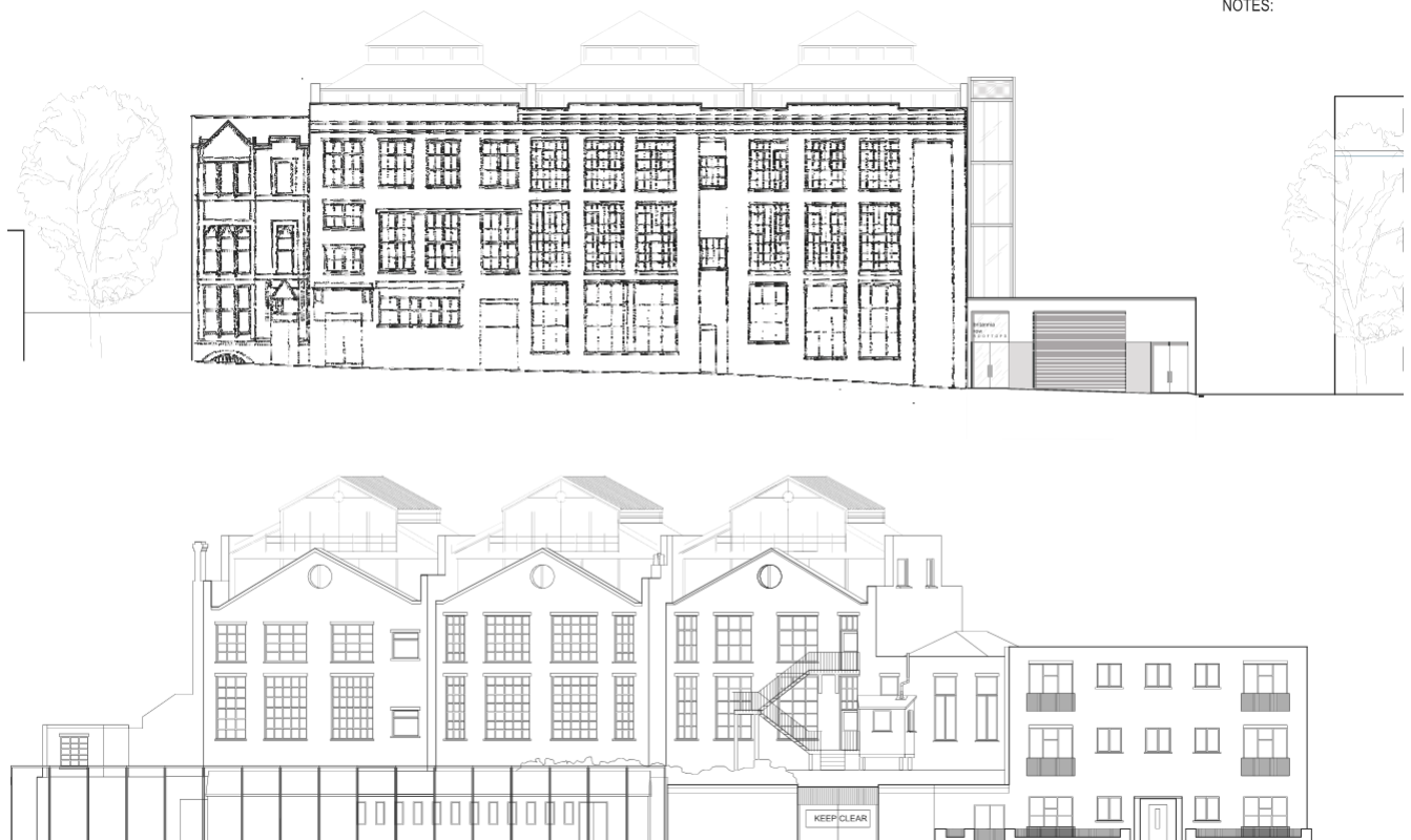
Image of extant permission from front elevation